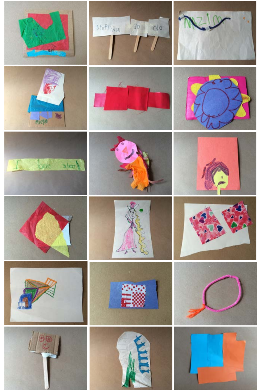
Above items were found in Art Boxes by Refill Volunteers.