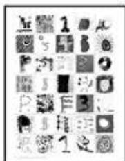
THE DEBUT KIDPRINT! FALL 2013