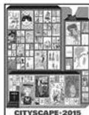
KIDPRINT! CITYSCAPE FALL 2015