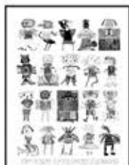
FUN FIGURE KIDPRINT! FALL 2014